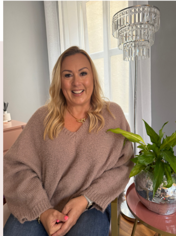
Caroline East – Copyright 2020 all rights reserved

Every human deserves to live a fulfilled, happy, and peaceful life. It's our birthright! And if this is what you've been searching for, then now is your time! The next chapter of your journey starts here!